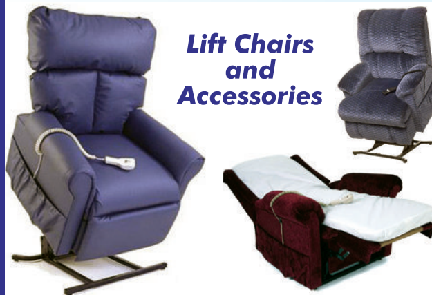
Lift Chairs and Accessories