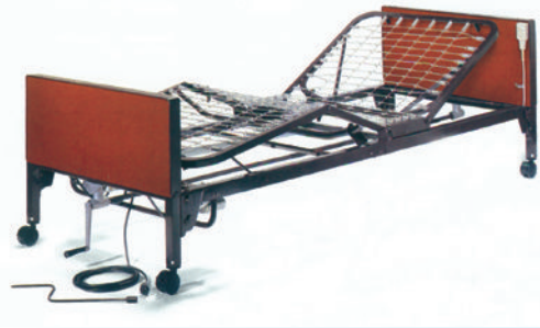
Homecare beds & accessories